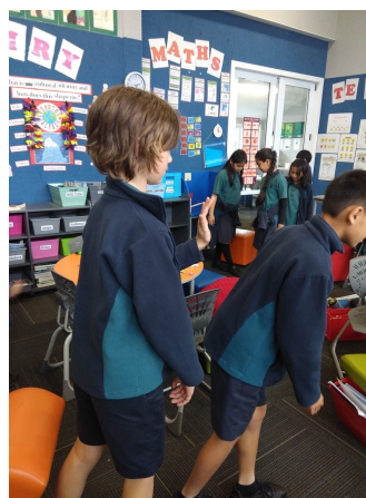
Year 4 students 'balancing'