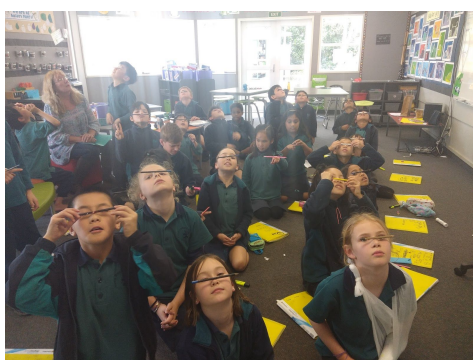
Year 6 students with a balancing investigation