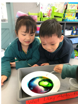
Year 1 students investigating colour and diffusion